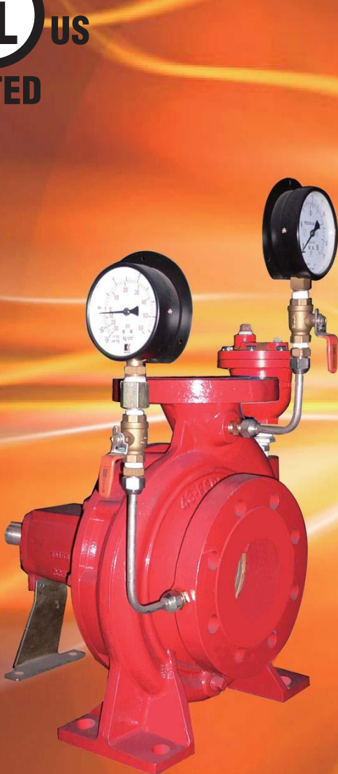
CENTRIFUGAL FIRE PUMP-END SUCTION