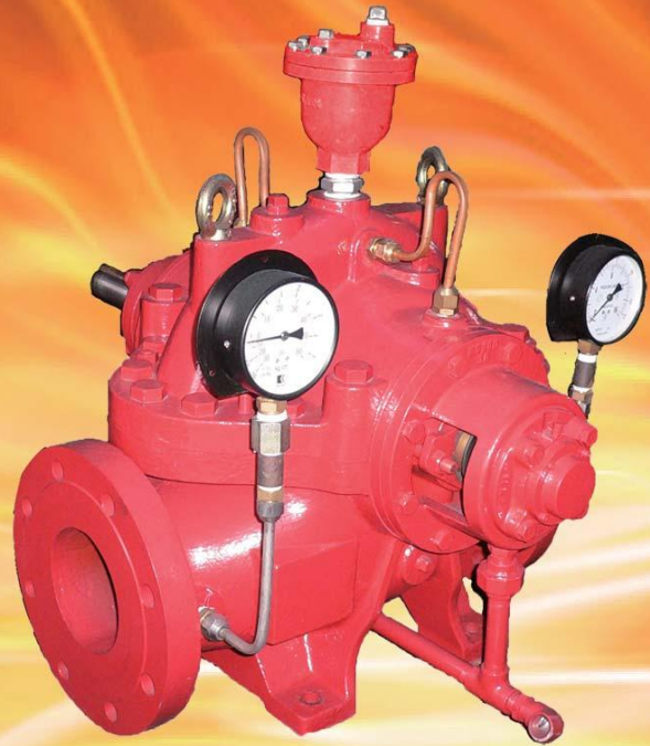
CENTRIFUGAL FIRE PUMP-SPLIT CASE